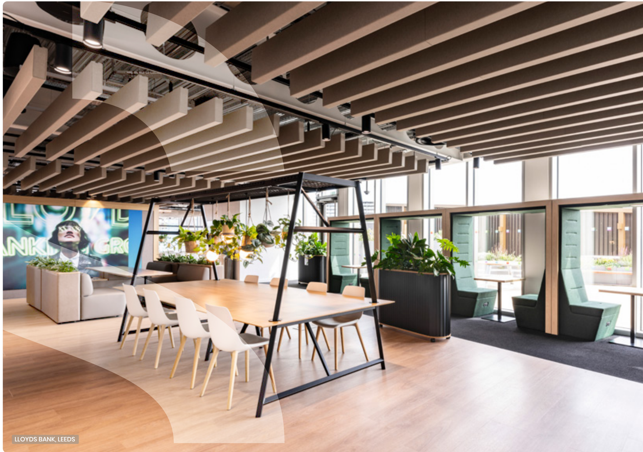
LLOYDS BANK, LEEDS